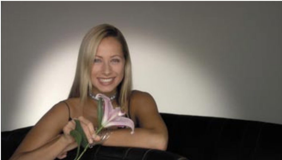
Figure 1 – true 16:9 image

Title Safe & Image Safe Area: Image Safe Area 5% from edges of image, Title Safe Area 10% from edges of image